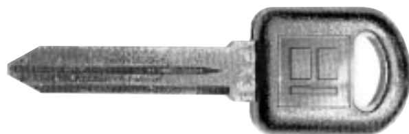
Passkey III (PK3), III+ (PK3+)