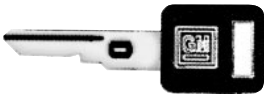
Passkey, Passkey II (PK2)