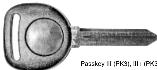
Passkey III (PK3), III+ (PK3+)